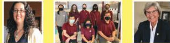
...and members of the Church of Saint Ann and the Saint Ann School