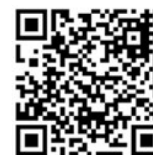
Athletic Virtual Open House