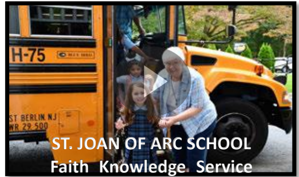
ST. JOAN OF ARC SCHOOL Faith Knowledge Service

All Registration Forms are Available Here or visit www.stjoans.org/st-joan-of-arc-school For More Information