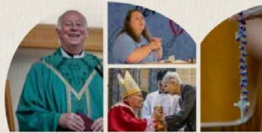
2022 ANNUAL CATHOLIC APPEAL