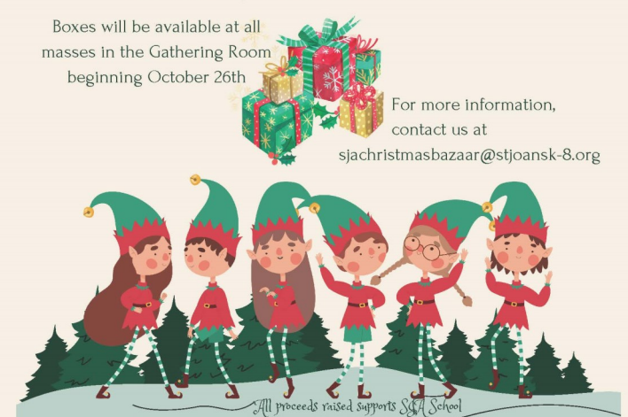
AT THE SJA CHRISTMAS BAZAAR